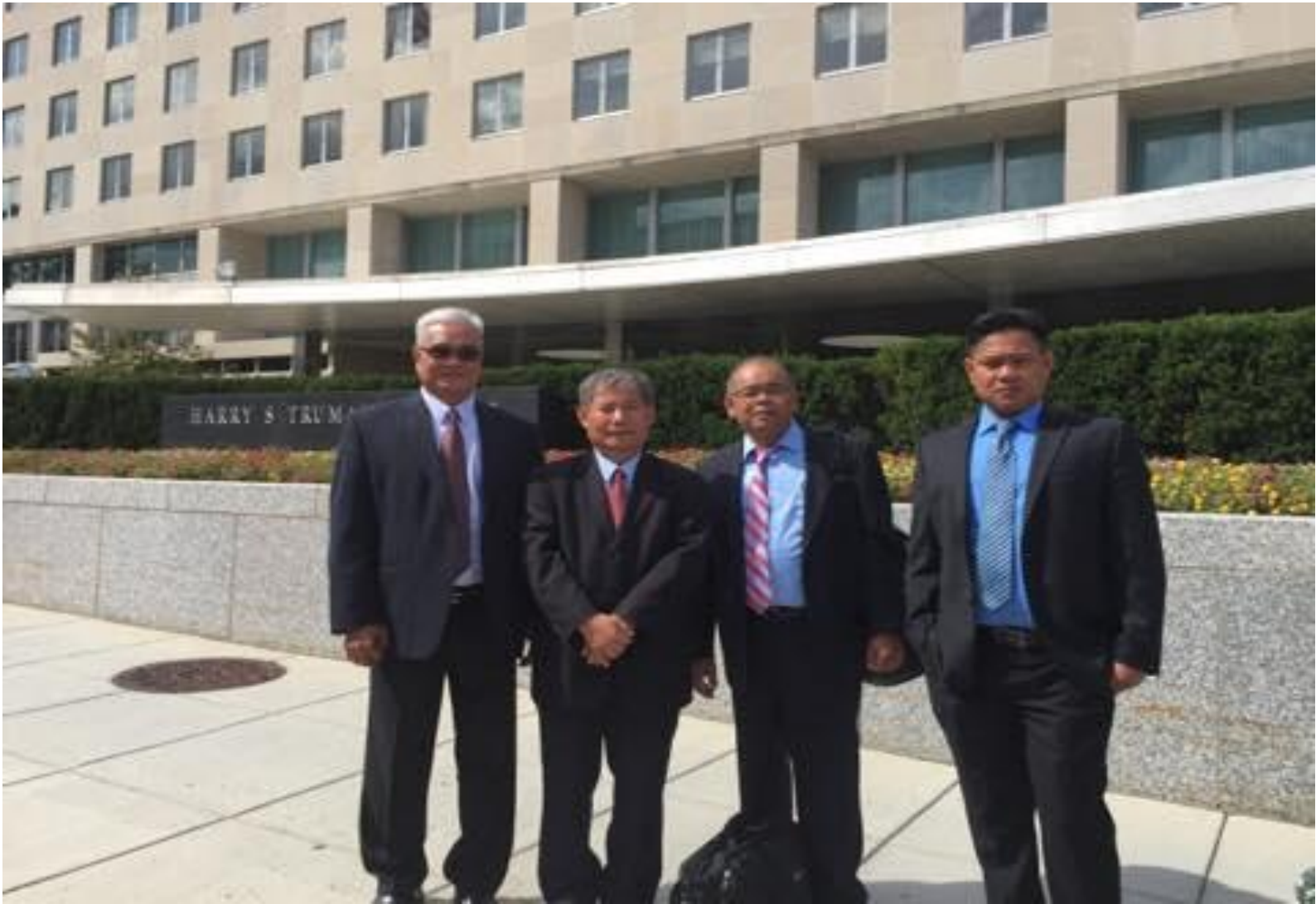
KKF Delegation met the officials of the US Department of States in Washington DC, 30 August 2017