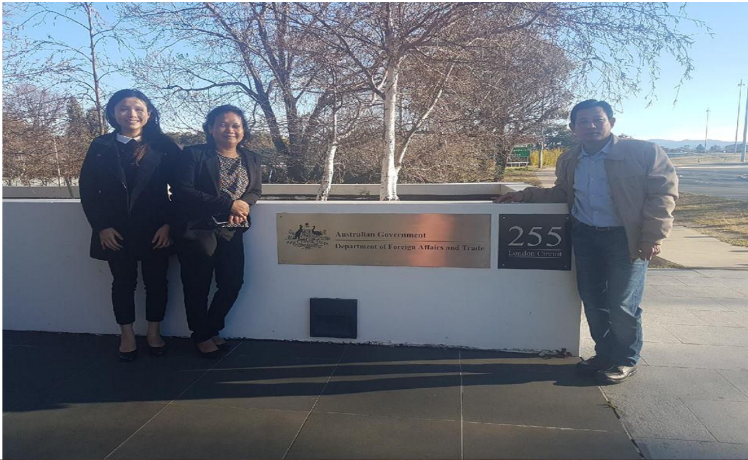
KKF Delegation from Sydney attended the follow-up meeting with DFAT on the 14 th Australia-Vietnam Human Rights Dialogue in Canberra, Australia, 1 September 2017