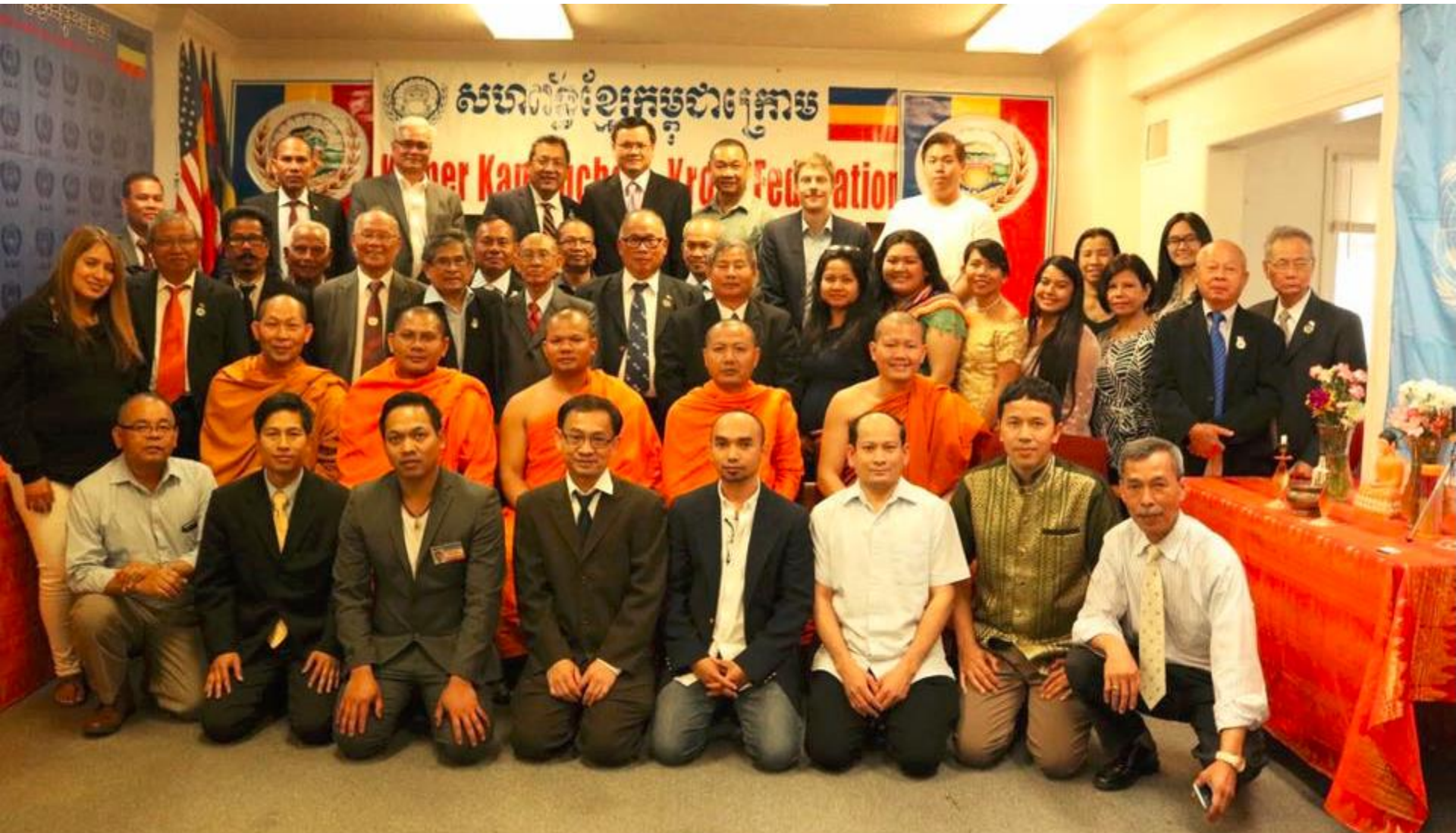
KKF Leaders attended the KKF Youth Conference in Philadelphia, 29 April 2017