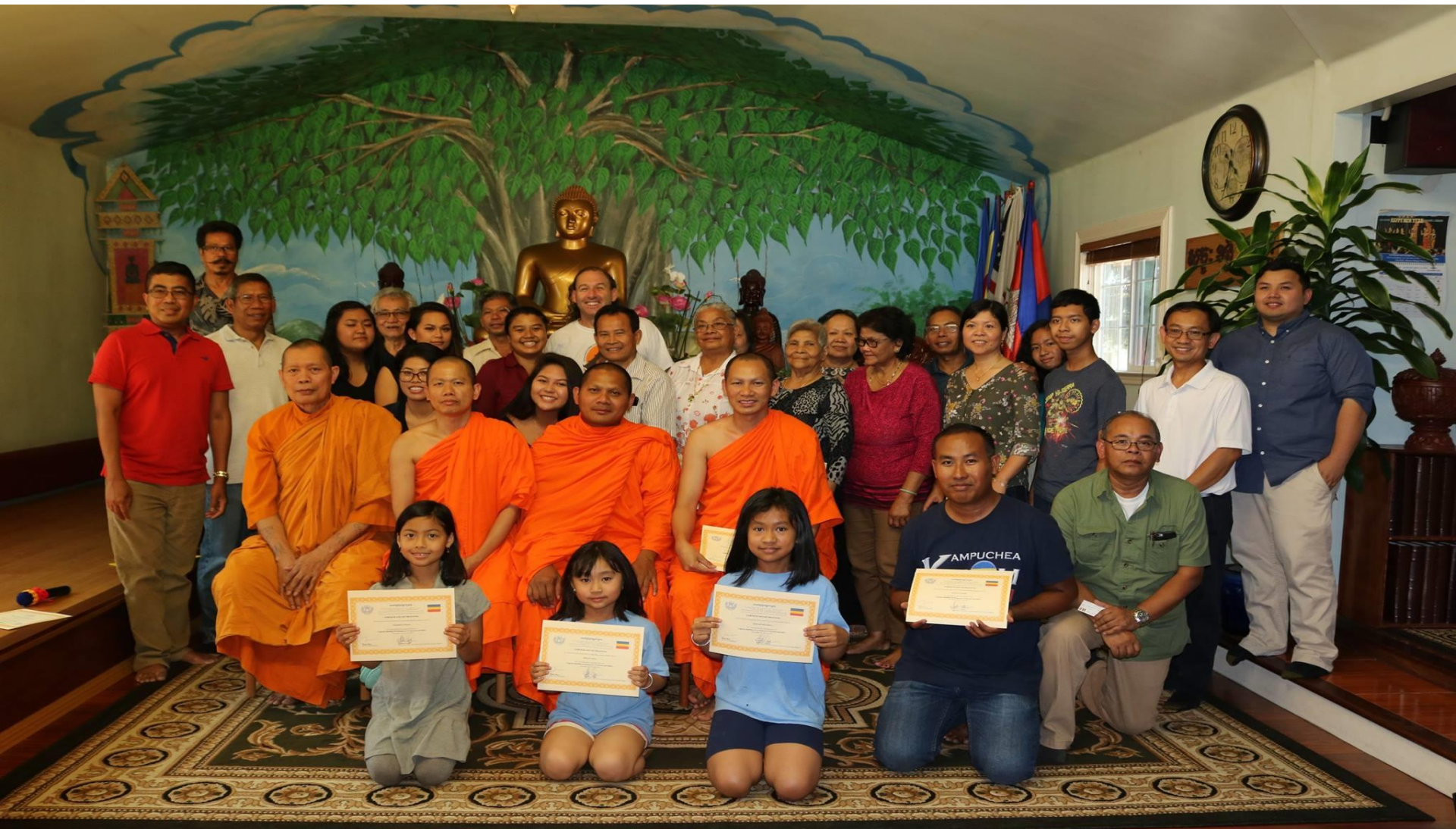
KKF organized a Capacity Building Workshop to educate members on UN System and SDGs in San Jose, 30 July 2017