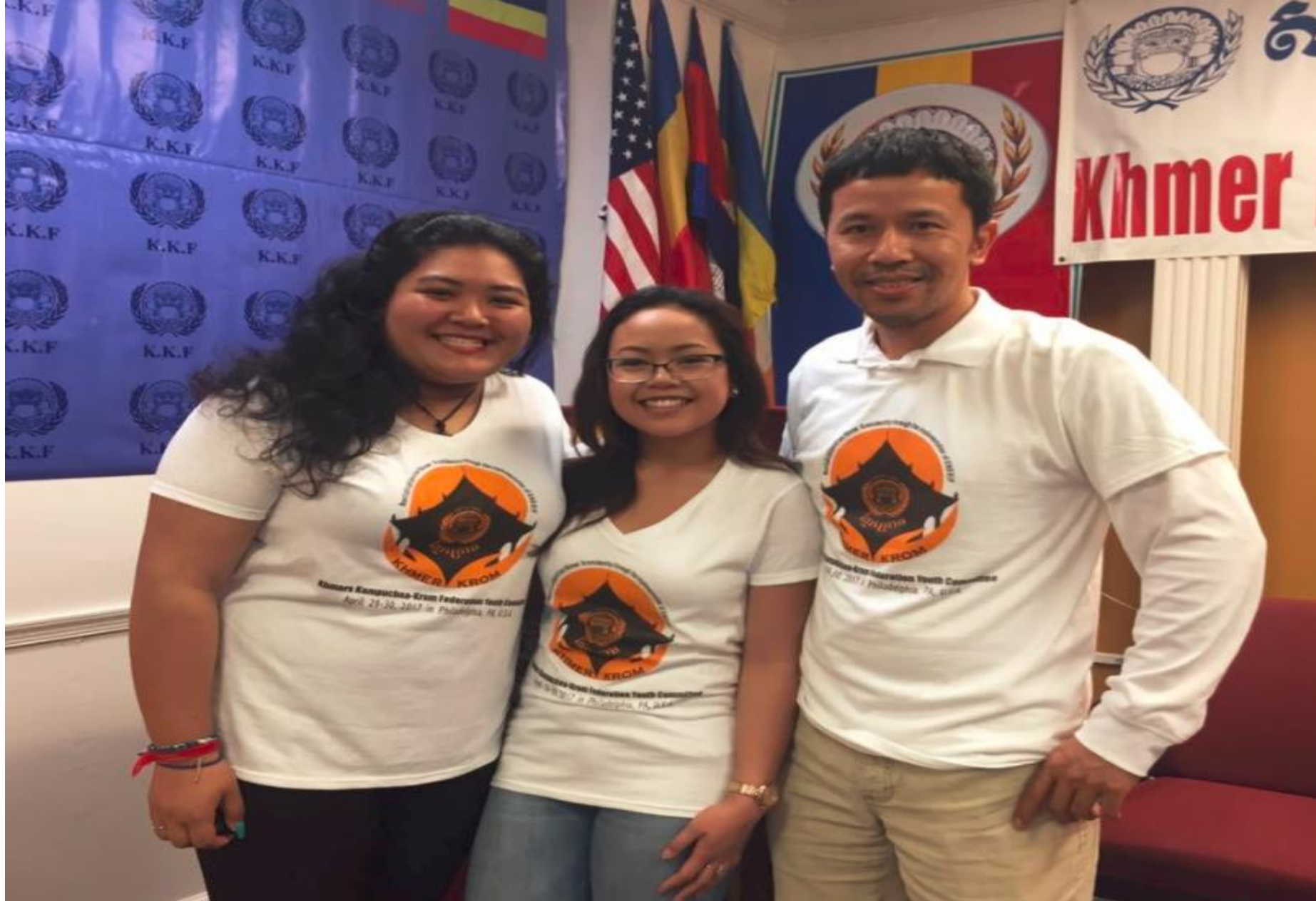
KKF Youth Conference designed a T-Shirt logo to promote protecting Khmer-Krom Identity through the UNDRIP at the KKF Youth Conference in Philadelphia, 29 April 2017