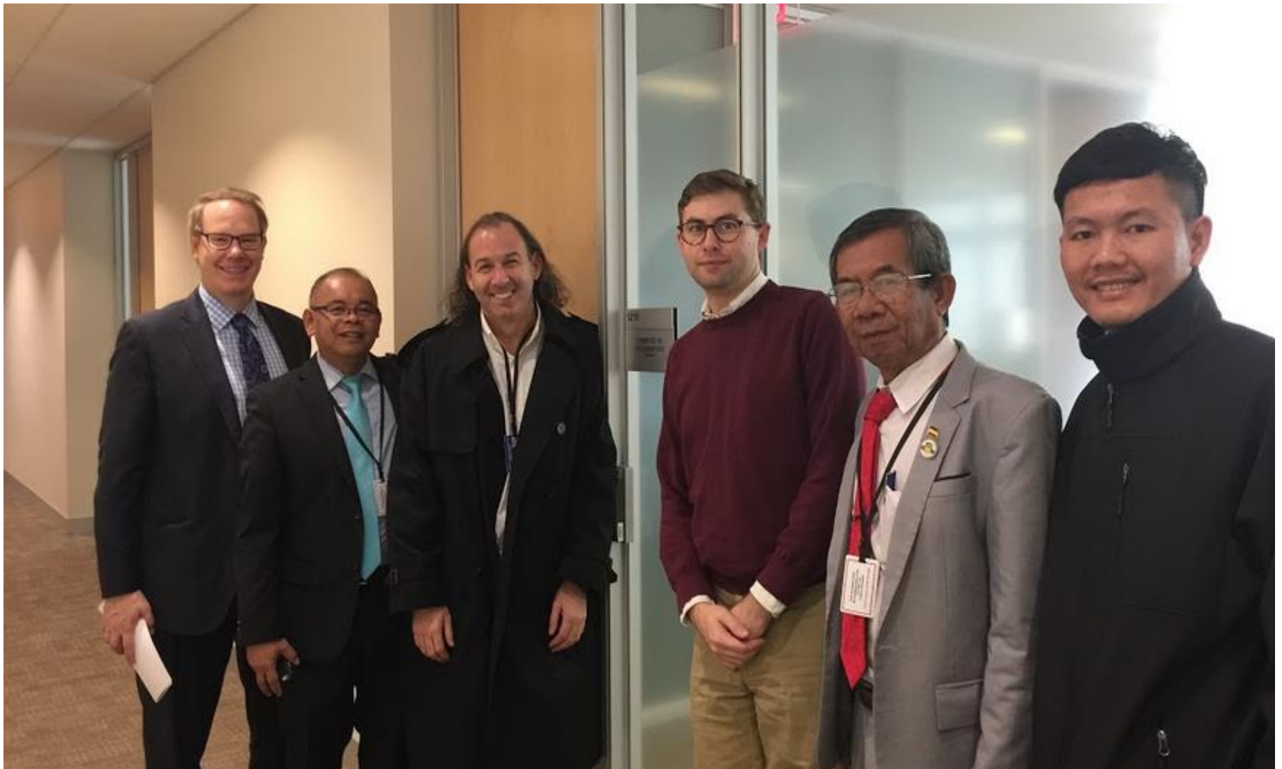
KKF Delegation met U.S. Commission on the International Religious Freedom In Washington DC, 26 January 2017