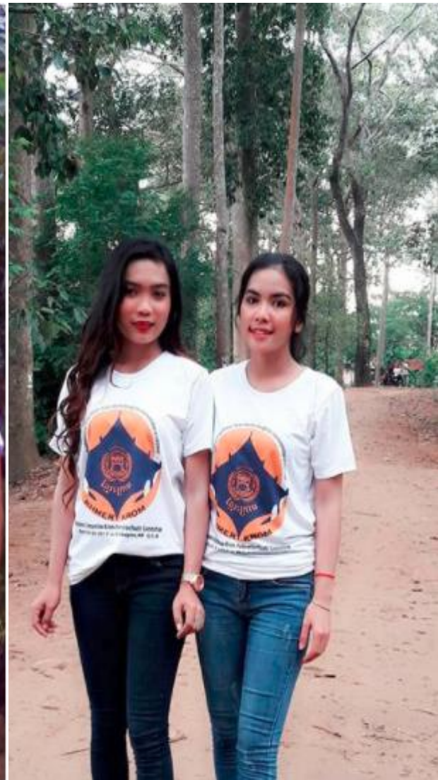
Inspiring by the T-Shirt of KKF Youths, the Khmer-Krom Youths in Preah Trapeang bravely printed that T-shirt to wear. Consequently, they were summoned and intimidated by the Vietnamese local authority in Preah Trapeang