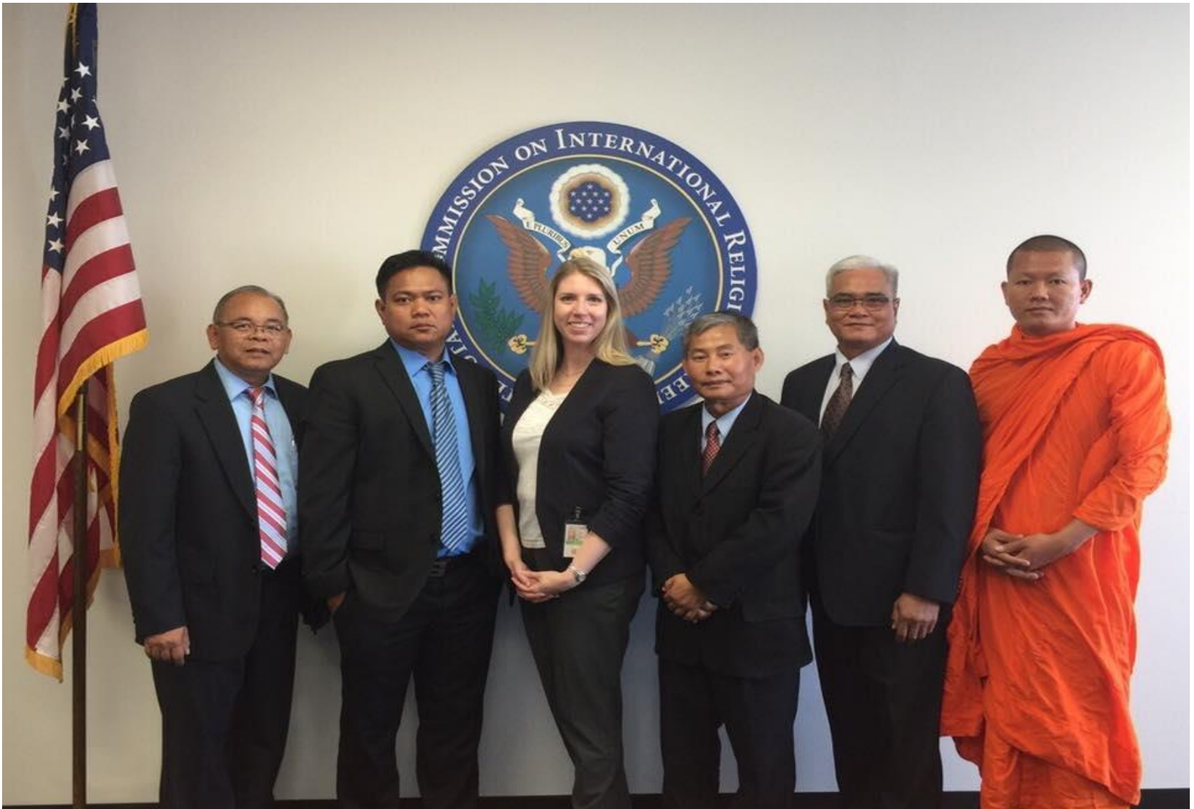
KKF Delegation met the official of the US Commission on International Religious Freedom in Washington DC, 30 August 2017