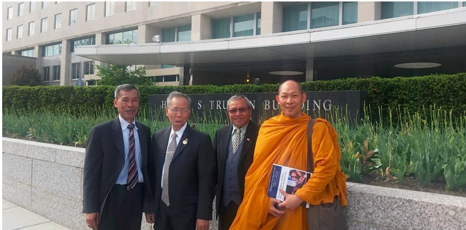
KKF delegation met with the U.S. Department of States, regarding the human rights violations against Khmer-Krom in Mekong Delta, in Washington DC, 27 April 2017