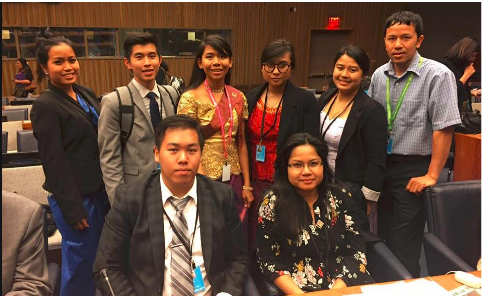
KKFYC members attended the Second Week of the UNPII in 2017