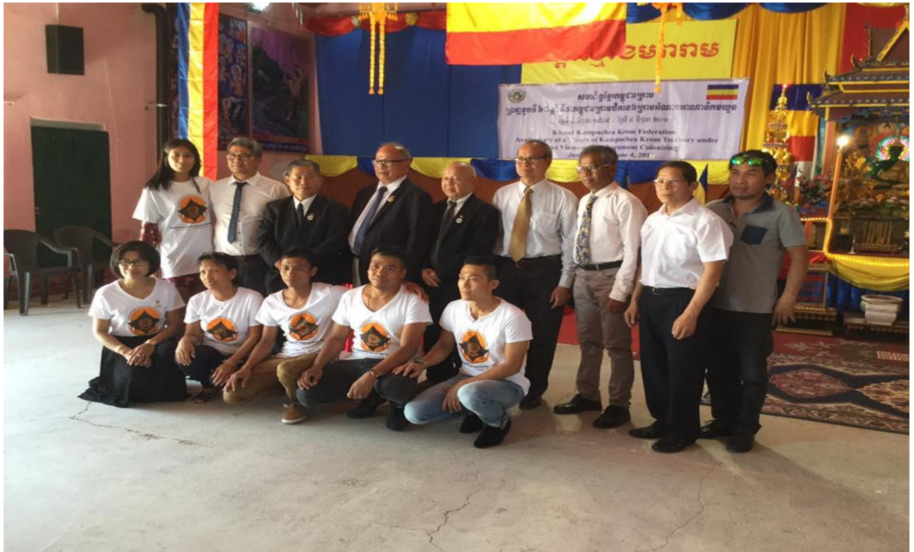
KKF Delegation took picture with KKF Youths at the June 4 th Commemoration Event in Italy, 10 June 2017