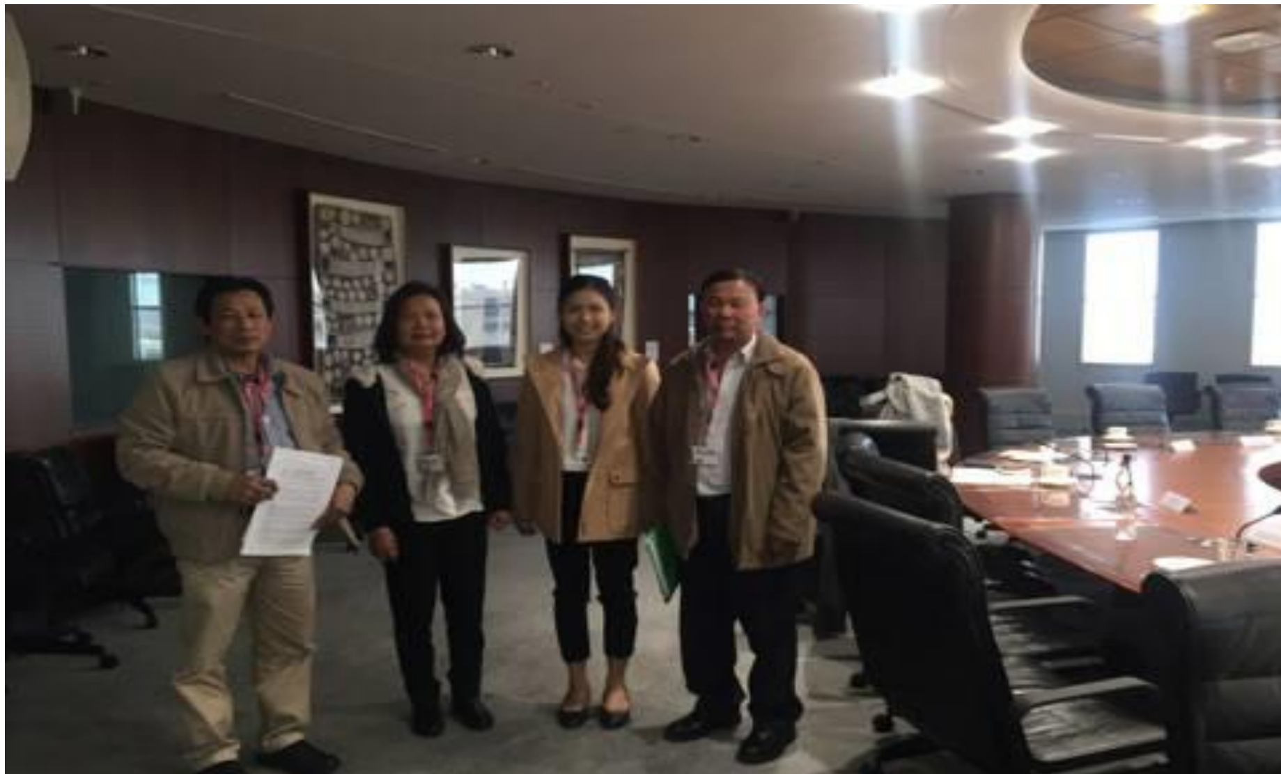
KKF Delegation from Sydney attended the Civil Society Organization Consultations meeting with DFAT prior to the 14 th Australia-Vietnam Human Rights Dialogue, in Canberra, Australia, 12 July 2017