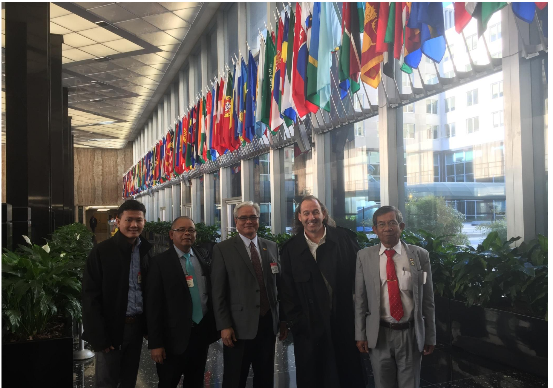
KKF Delegation met US Department of States in Washington DC, 26 January 2017