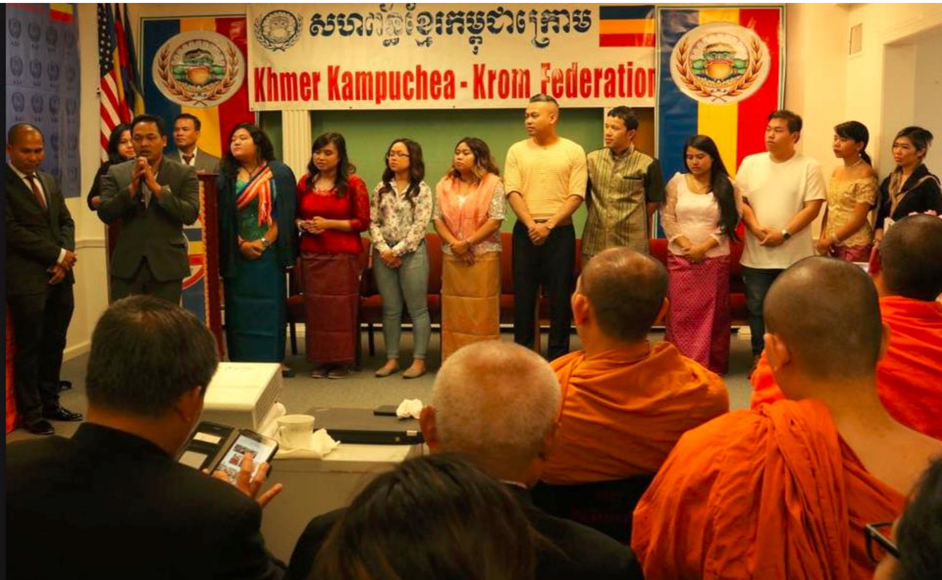
KKFYC members introduced themselves and their activities at the KKF Youth Conference in Philadelphia, 29 April 2017