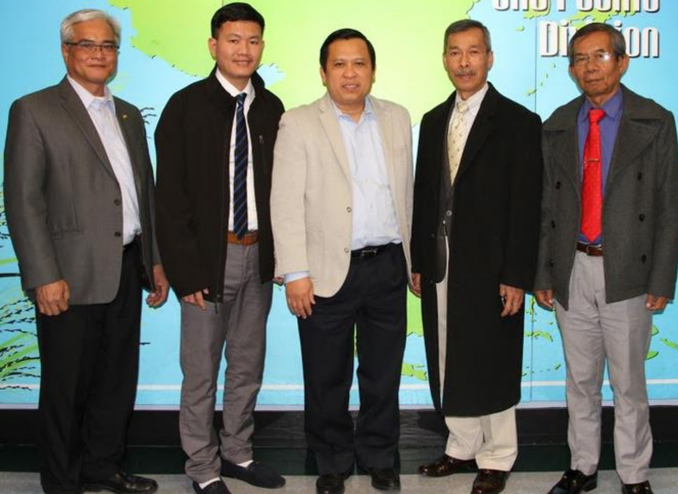
KKF Delegation were interviewed by VOA in Washington DC, 27 January 2017

Burmese Cantonese Indonesian Khmer Korean Lao Mandarin Thai Tibetan Vietnamese