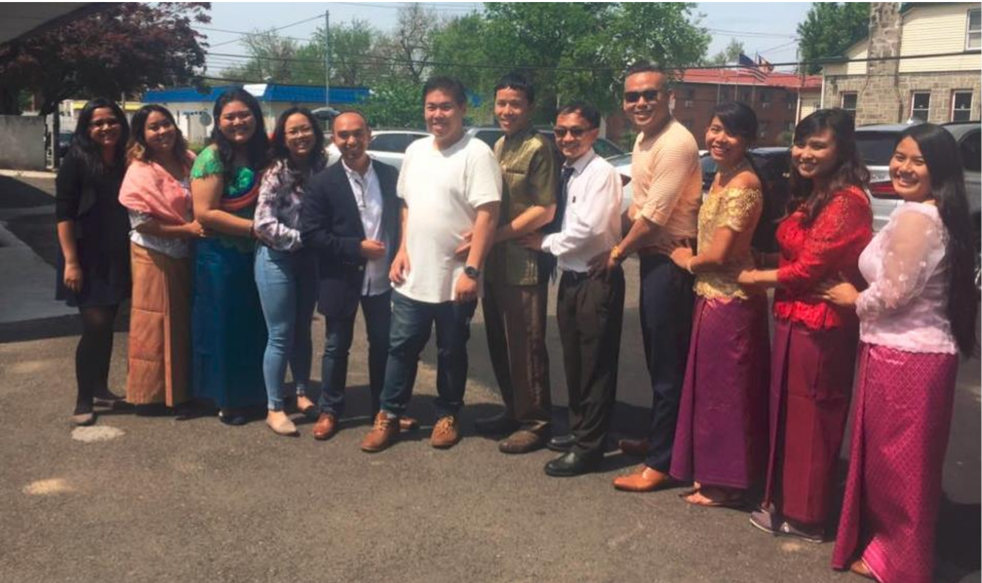
KKF Youths – Work Hard & Having Fun - to Seek Justice for the Voiceless Khmer-Krom KKF Youth Conference in Philadelphia, 29 April 2017